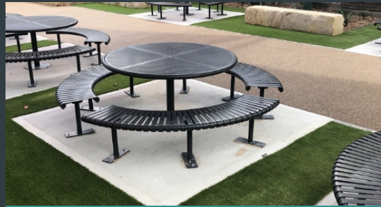
PERMASTONE PRO PATHWAY & TURF