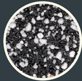
BLACK & WHITE

AVAILABLE IN A VARIETY OF COLOURS AND STONE SIZE