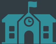
SCHOOLS & ACADEMIC FACILITIES