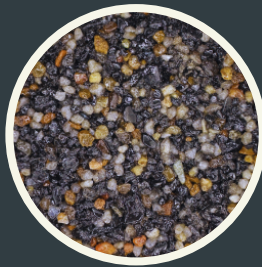
BLACK TAN ASH